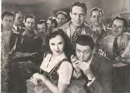
Pauline Goddard, James Stewart and Horace Heidt in a scene from "Pot o' Gold."

Although the weeks between the "big" winter season and the summer holiday period show a